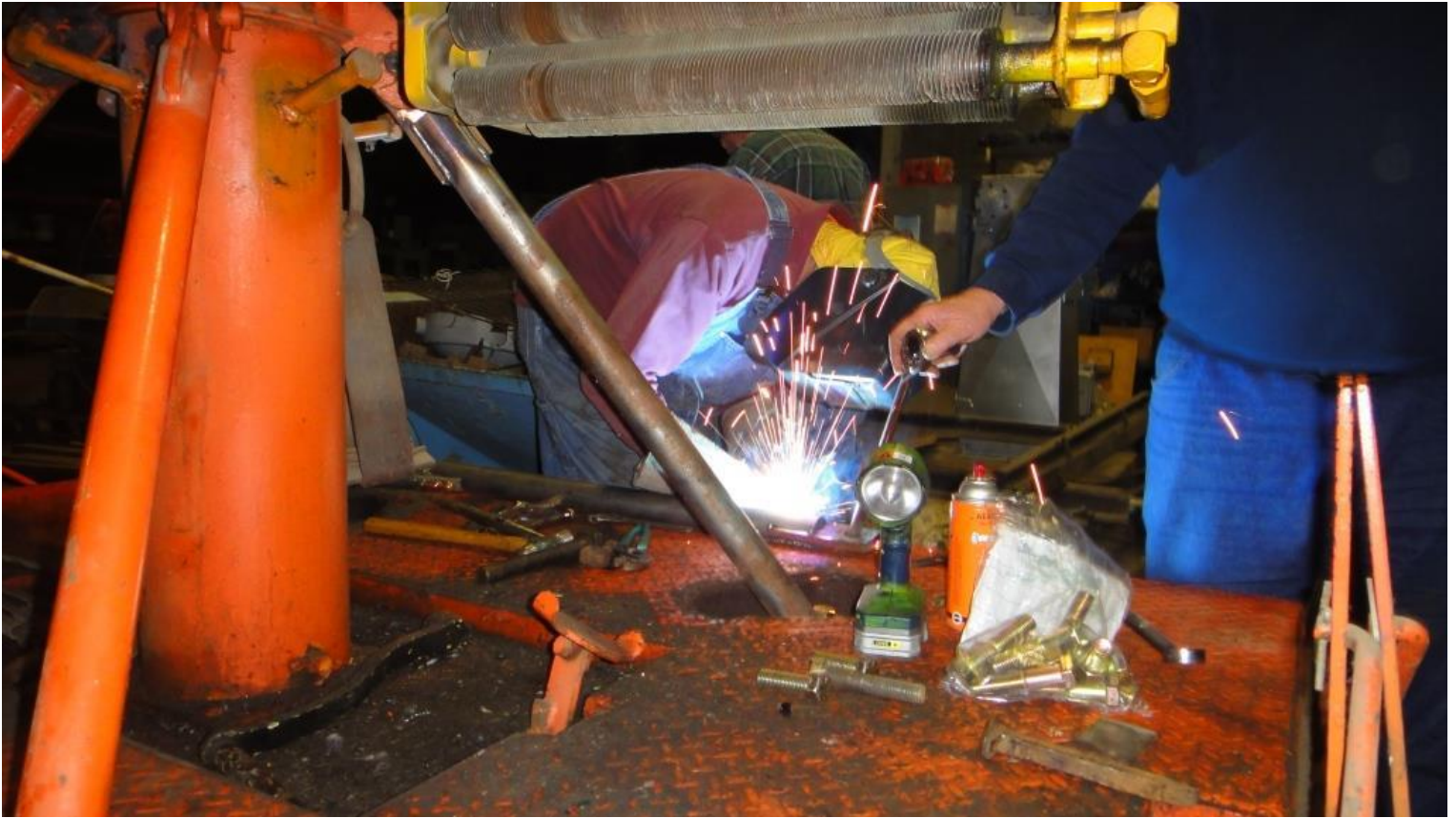
Cliff puts on a show welding a support-bracket together for the derrick crane