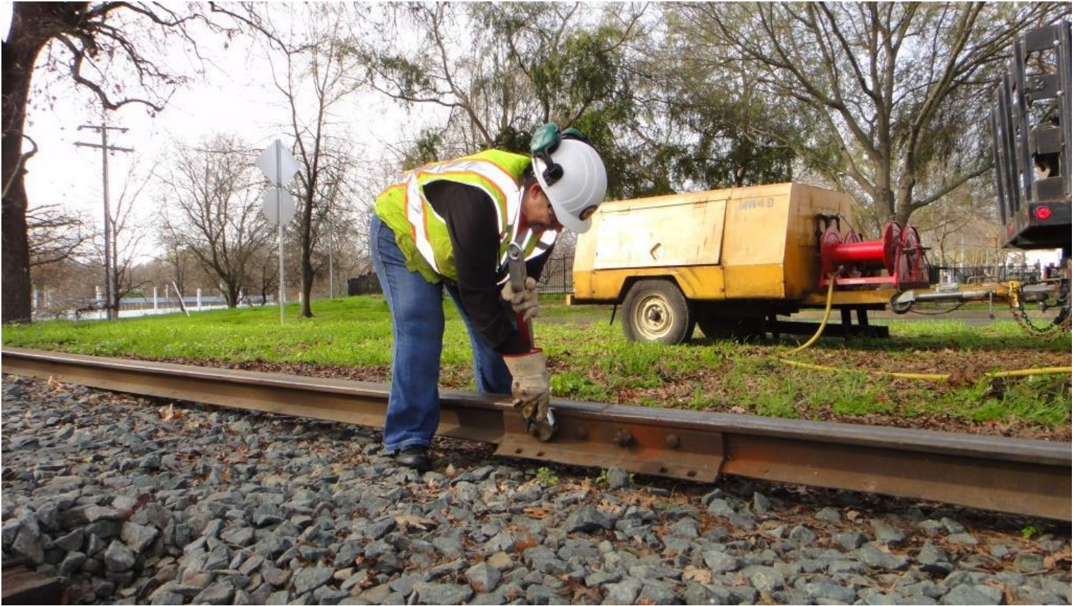
Meanwhile, Pam takes apart the old 75-pound rail...