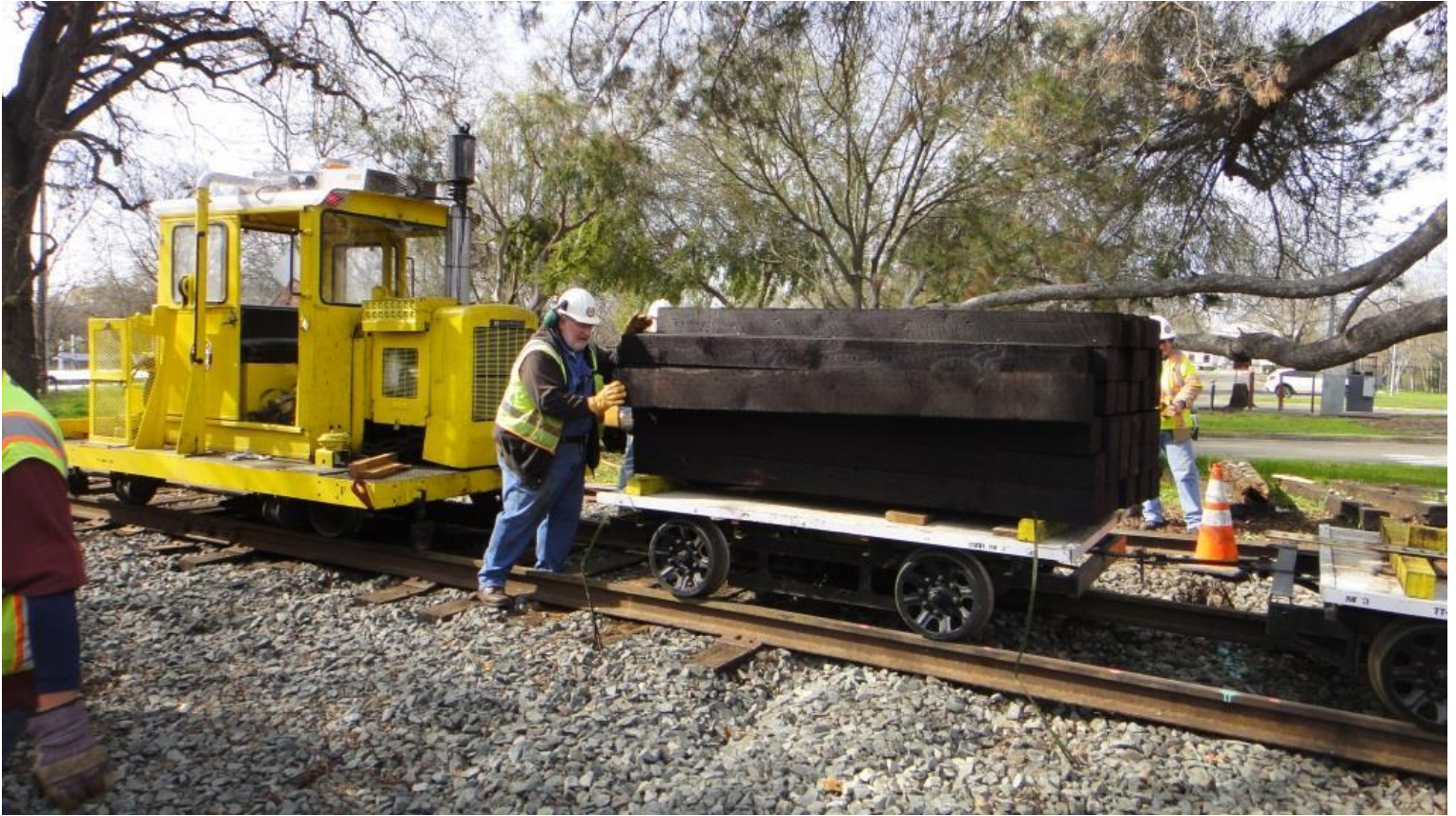
Frank distributes ties for insertion at the south end near the switch