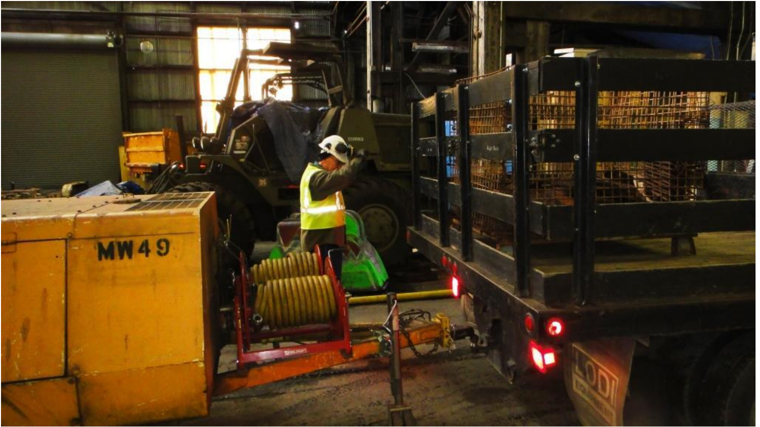
Clem guides the truck in for a perfect “hook” with the air-compressor