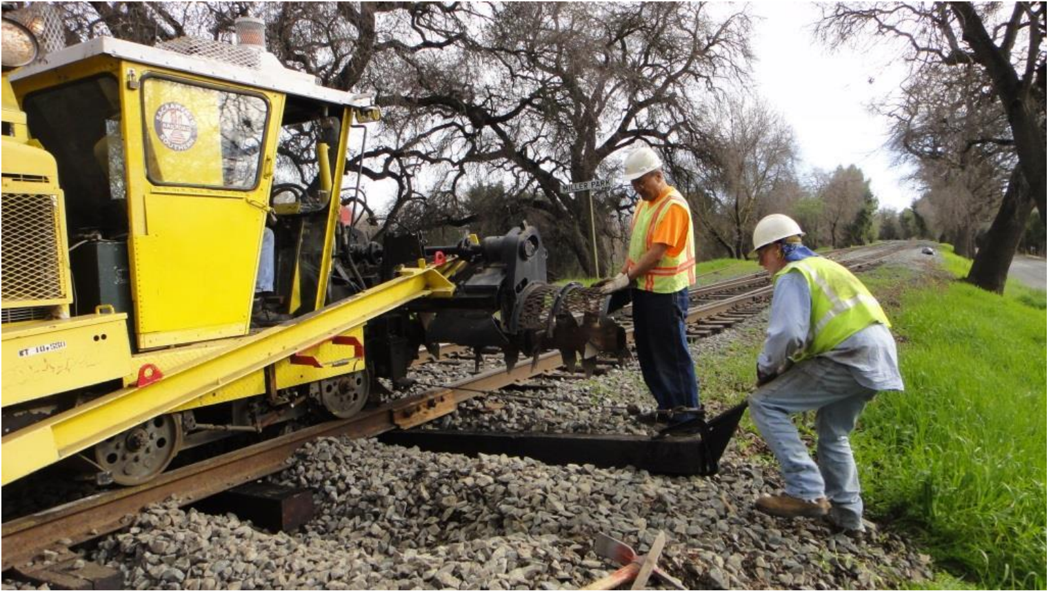
OK, that's better. Now it's working...