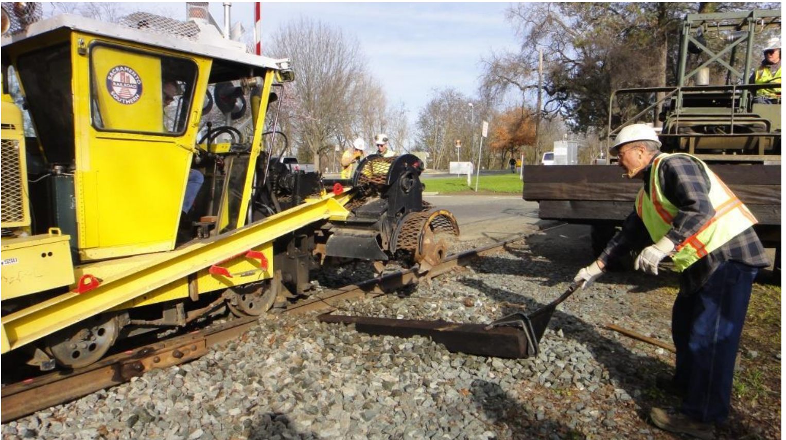
OK, that's more like it...