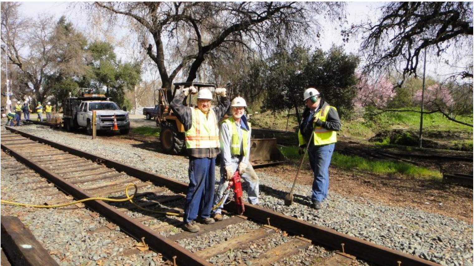
Batman vs. Superman!