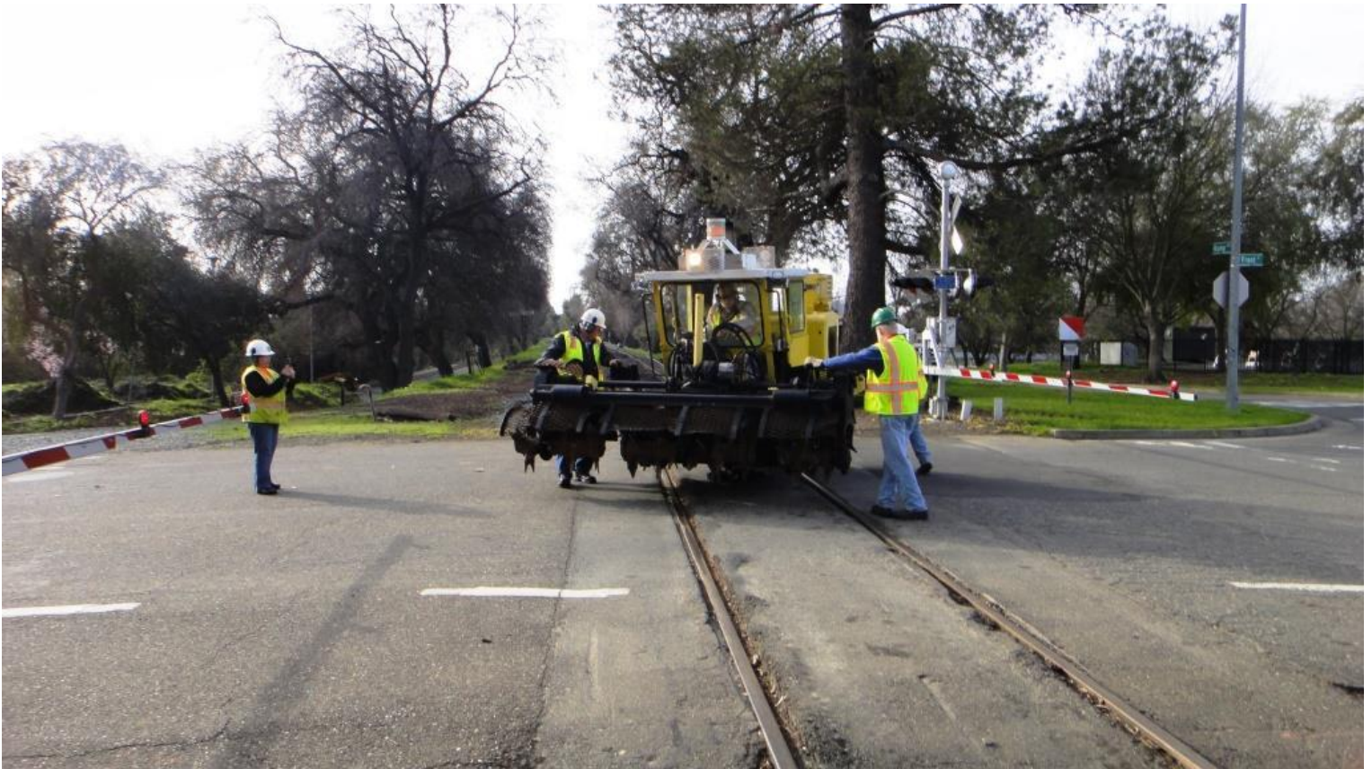
Alan goes for a spin in the scarifier